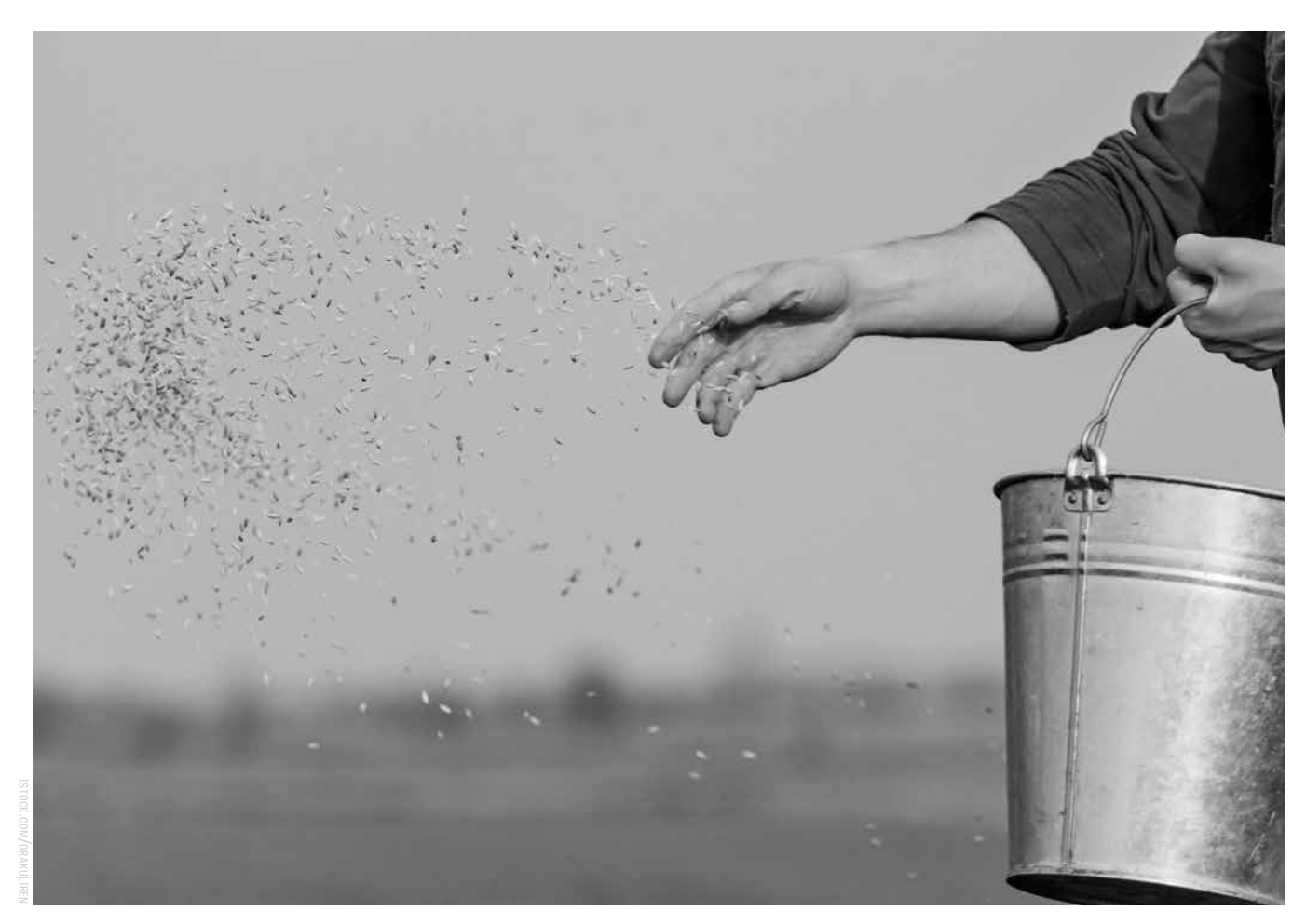
The parable of the sower illustrates what happens to different people who hear God's message.

"But he that received the seed into stony places, the same is he that hears the word, and anon with joy receives it; Yet has he not root in himself, but endures for a while: for when tribulation or persecution arises because of the word, by and by he is offended" (verses 20-21). This group has initial excitement about God's message, but their roots are shallow. Temptation, trials and persecution cause them to wither.