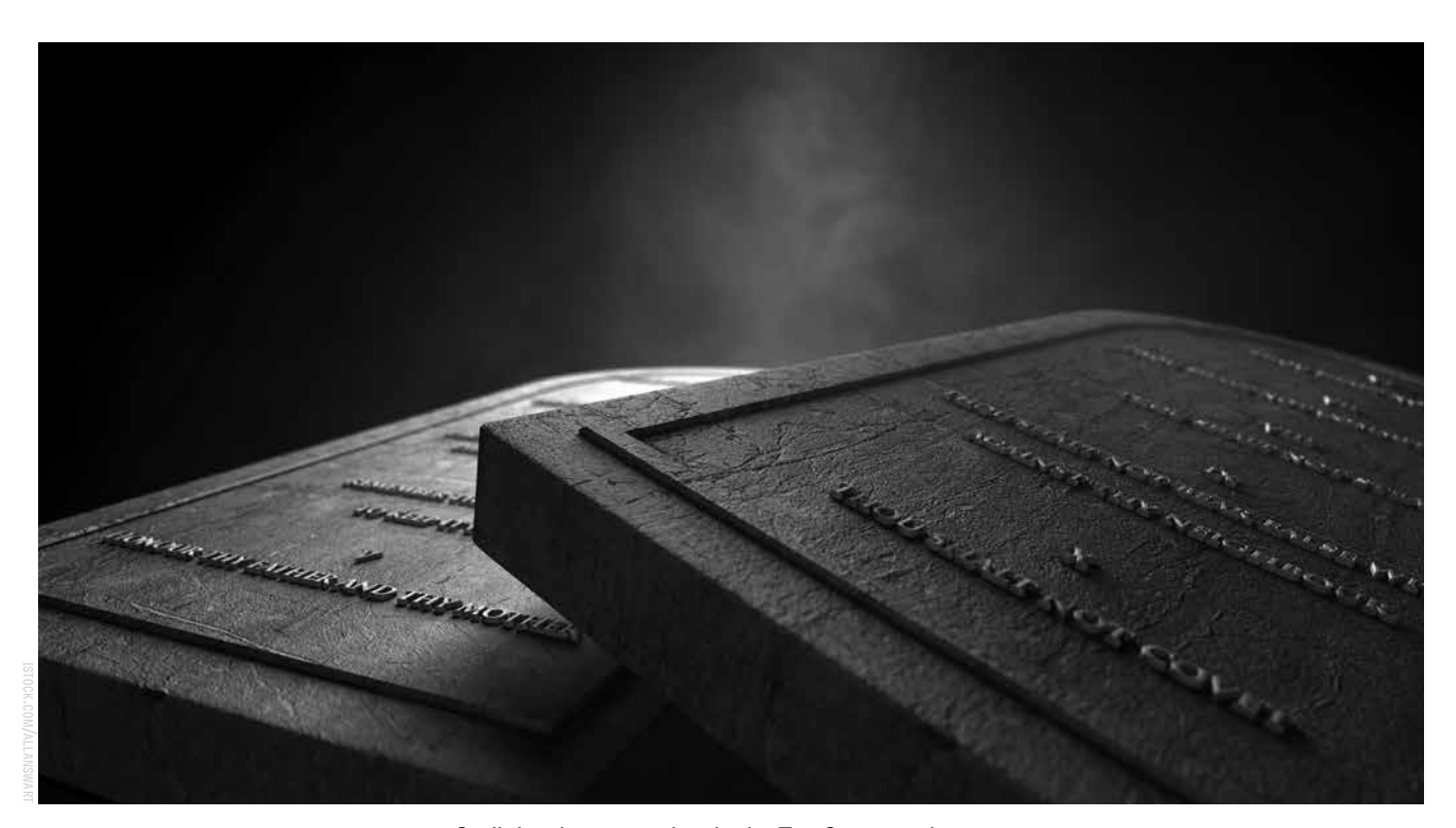
God's law is summed up in the Ten Commandments.

Leading religious Jews like the Pharisees prayed in public. Everyone could see their "good works," yet