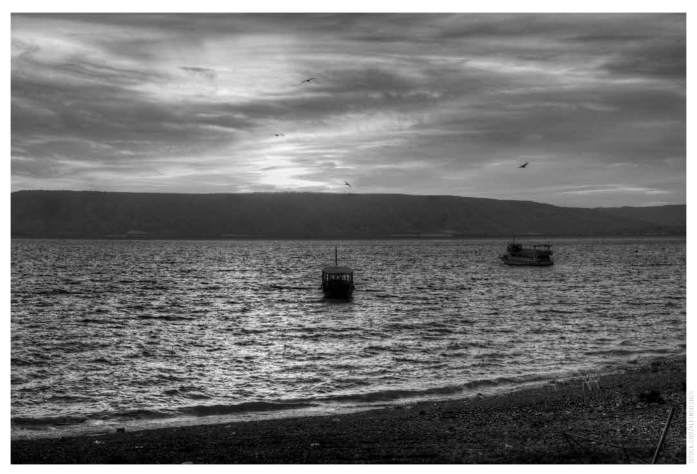
Jesus Christ calmed a storm on the Sea of Galilee.

An unusually violent storm arose, creating huge waves (Luke 8:23). Water pounded against the boat and over it. Though some of the disciples were experienced fishermen, as water began to fill the boat, they feared they would sink and drown.