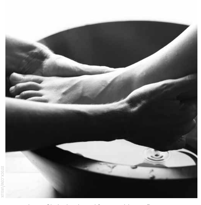
Jesus Christ instituted foot washing at Passover.

The more people flocked to hear Jesus preach, the more the religious leaders opposed Him. These men held government positions over the other Jews, but they were ruled by the government of the Roman Empire. They feared that if people followed Jesus, the empire would punish them for failing to control the Jews. They actively looked for any possible opportunity to discredit Jesus.