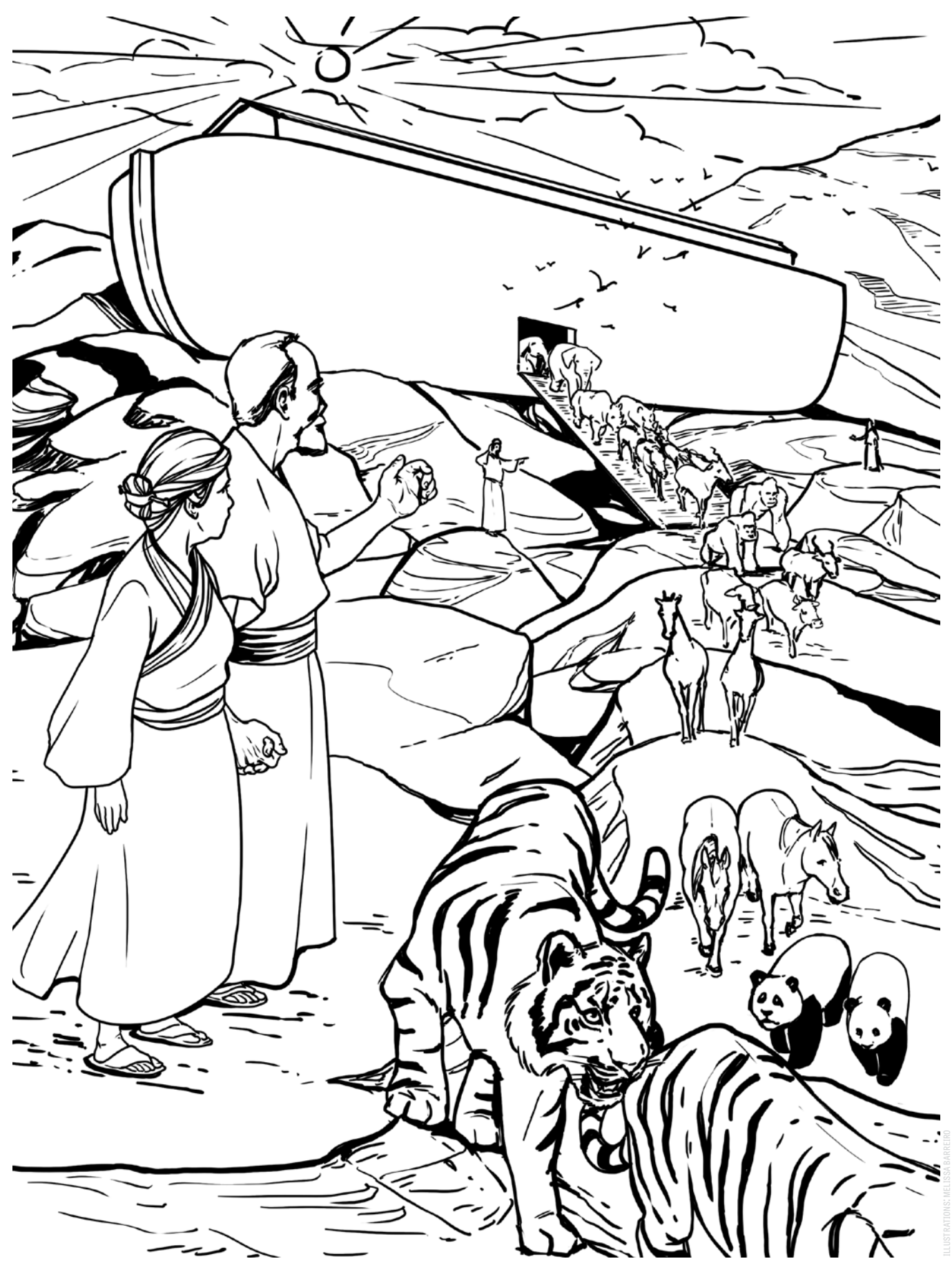
Animals leave the ark.