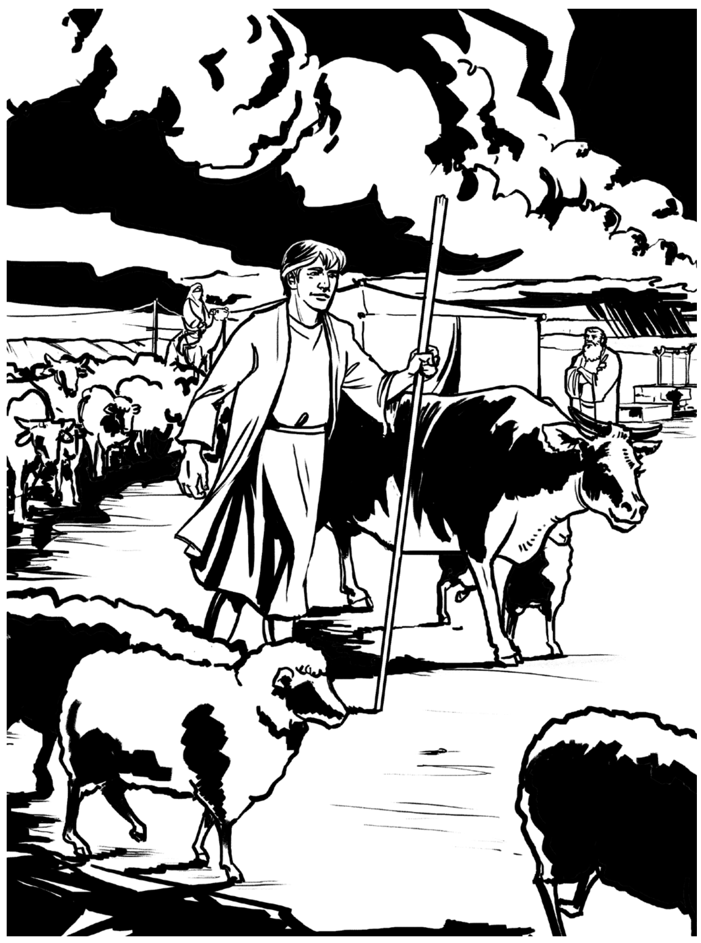
Jacob watches over Laban's flocks.