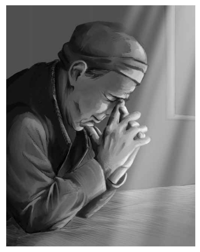
Samuel was very close to God, and sought His instruction.

therefore present yourselves before the LORD by your tribes, and by your thousands."