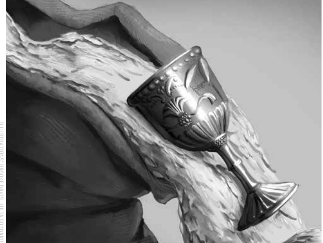
Joseph's cup is discovered in Benjamin's grain sack.

money inside their grain sacks. When the brothers discovered the money on their way home, they thought the Egyptians would accuse them of stealing.