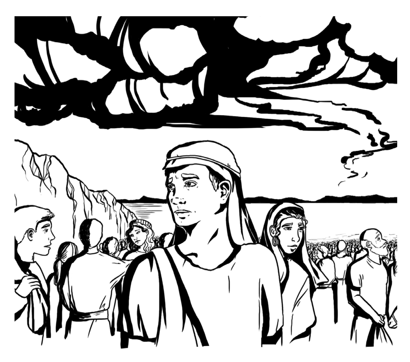
The Israelites are trapped between the mountains and the sea.

borns spared, left slavery behind and became free. This was a night to be much observed .