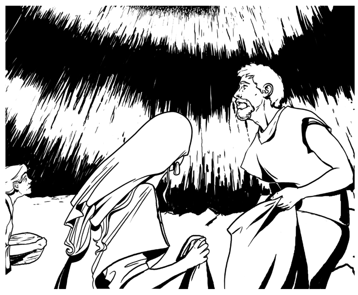
The Israelites cross the dry seabed of the Red Sea.

his mind. He mustered his army and pursued the Israelites. He would capture them, kill some of them, and bring the rest back into slavery. Pharaoh's warhorses and chariots closed in on the Israelites beside the Red Sea. Blocked by the army, the mountains and the sea, the Israelites were trapped.