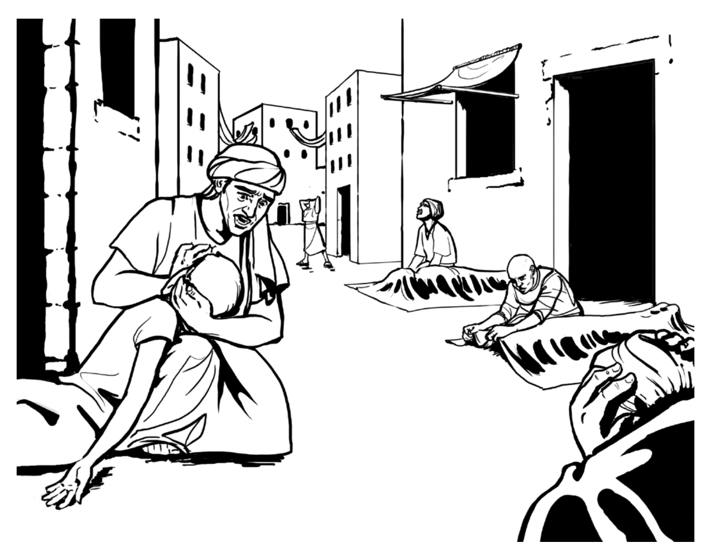
The final plague on Egypt is the death of the firstborn.

That night, God sent His death angel to the land of Egypt. The angel passed through the land and killed every firstborn who was not in a house marked by a lamb's blood. The death angel passed over all the houses marked with blood, so