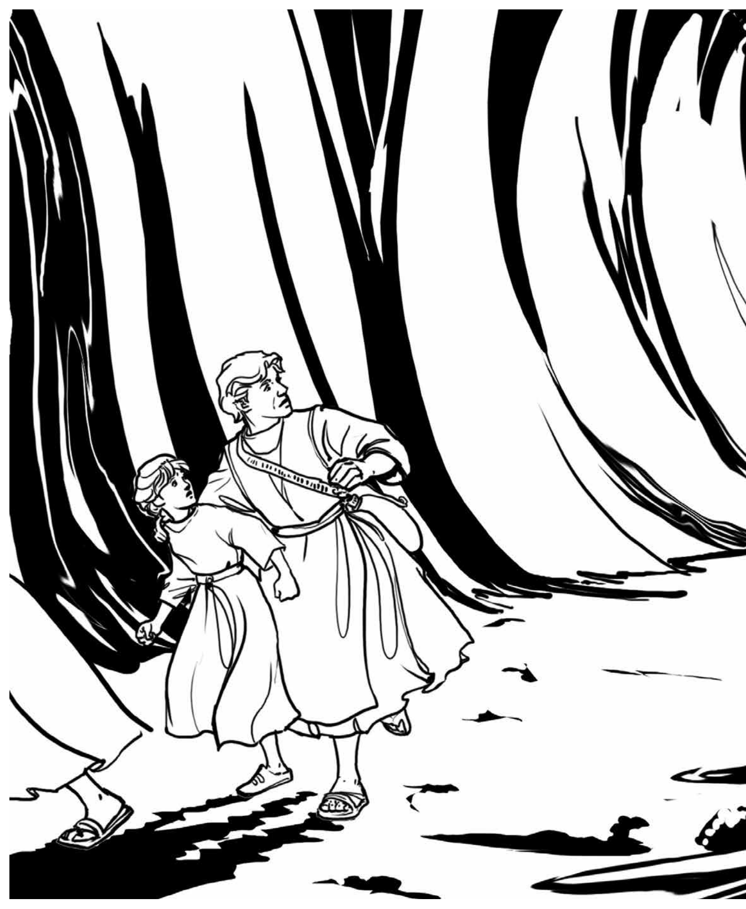
Pharaoh's army pursues the Israelites through the Red Sea.