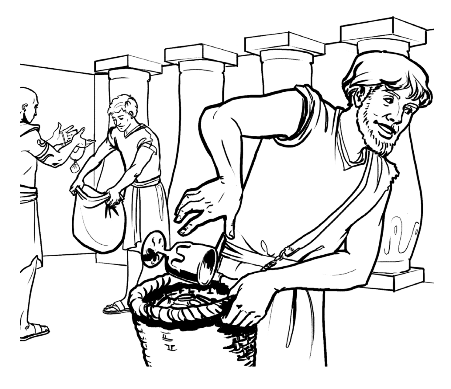
The Israelites spoil the Egyptians as they leave Egypt.

this night is called Passover . Messengers woke Pharaoh with the terrible news, and he discovered that his own firstborn son was dead. Every family in Egypt had at least one dead firstborn! Even the firstborn of animals were killed.