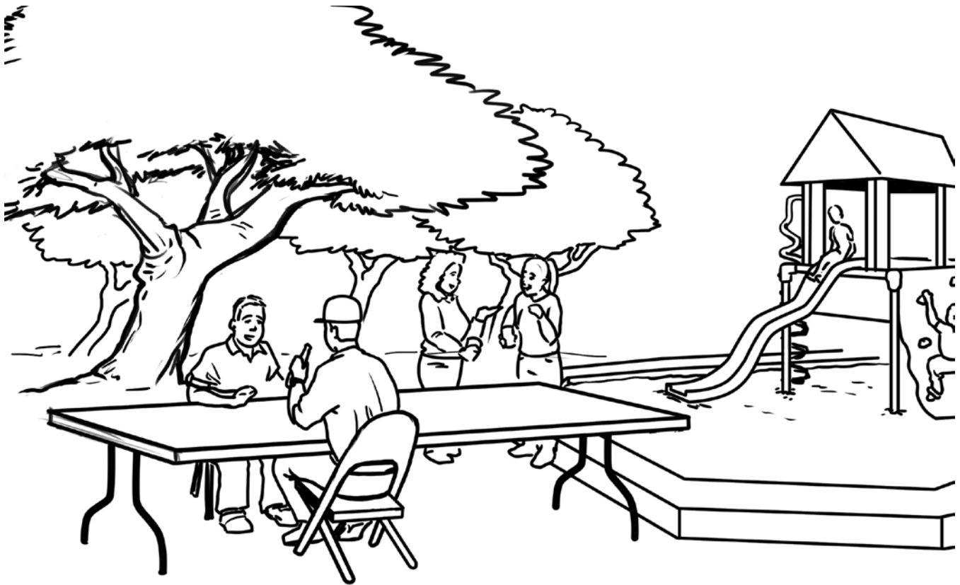
Families enjoy extra time together at the Feast of Tabernacles.

capacity to help serve all who make it through the Tribulation. Your father and I will be born into God's Family, so we will be spirit beings; and you will be helping all of us in God's Family to teach human beings about God's way of life."