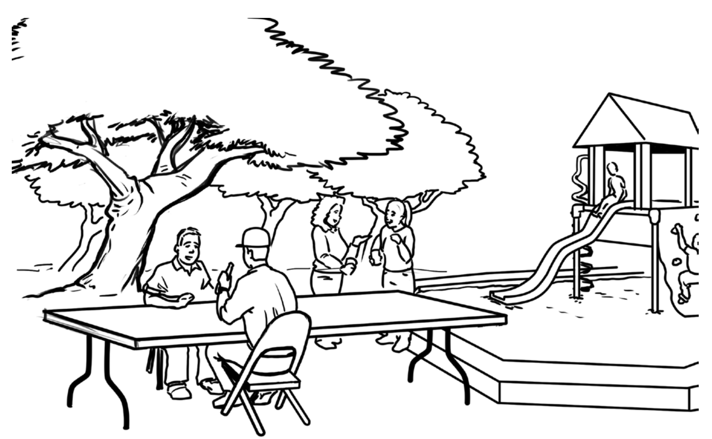
Families enjoy extra time together at the Feast of Tabernacles.

capacity to help serve all who make it through the Tribulation. Your father and I will be born into God's Family, so we will be spirit beings; and you will be helping all of us in God's Family to teach human beings about God's way of life."