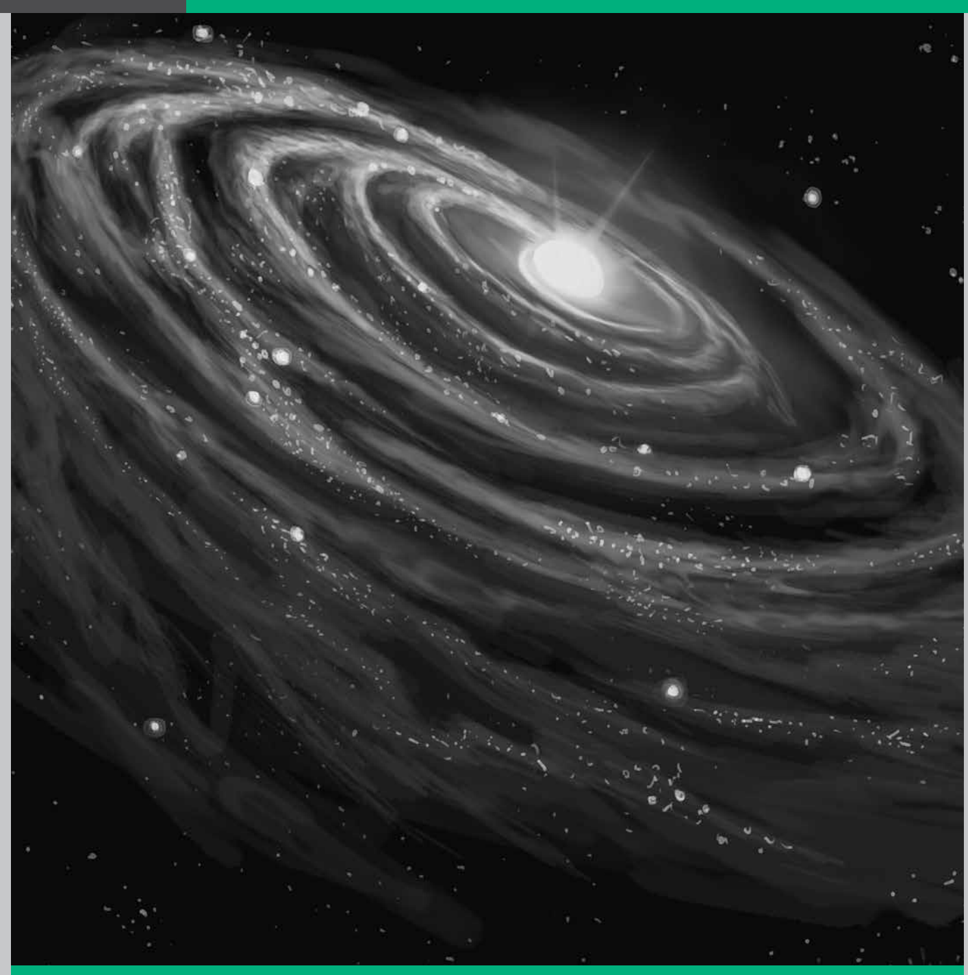
Why God Created the Universe