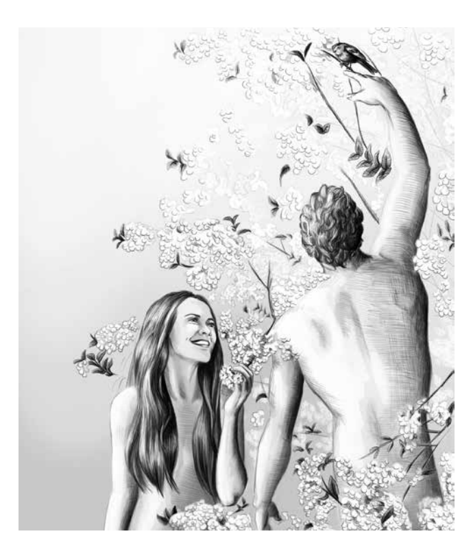
Adam and Eve were placed in the garden to keep it.

What do humans have that makes their minds different from animals?_____