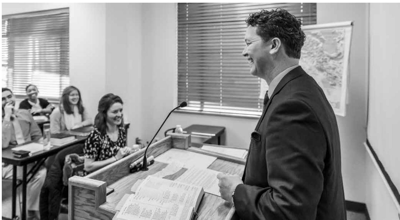
In the World Tomorrow, you will be a teacher.

God commands us to observe these seven festivals for a very special reason: They teach us the seven steps of His master plan for mankind! By observing