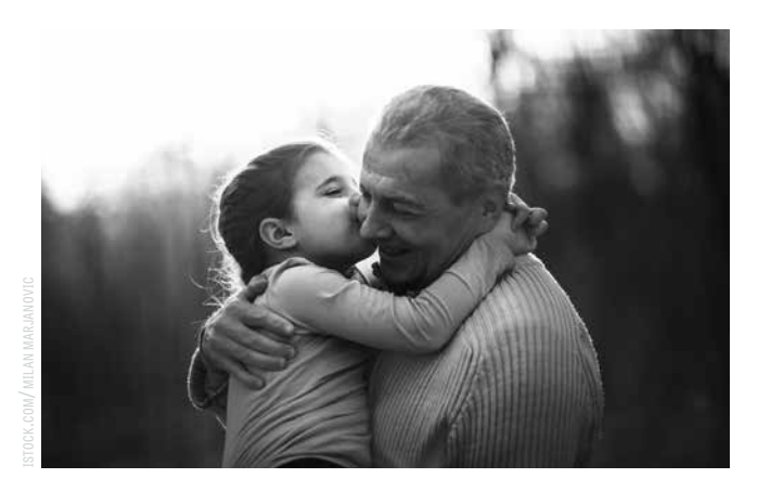
After the Millennium, you will help teach everyone who has ever lived. You might even teach your own family.

will teach people to obey and to love God.