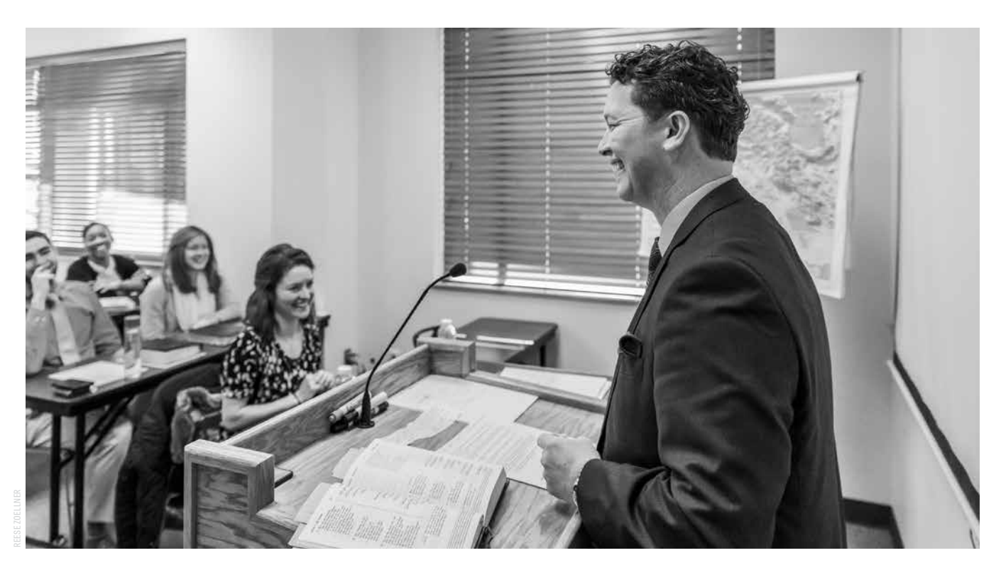
In the World Tomorrow, you will be a teacher.

God commands us to observe these seven festivals for a very special reason: They teach us the seven steps of His master plan for mankind! By observing