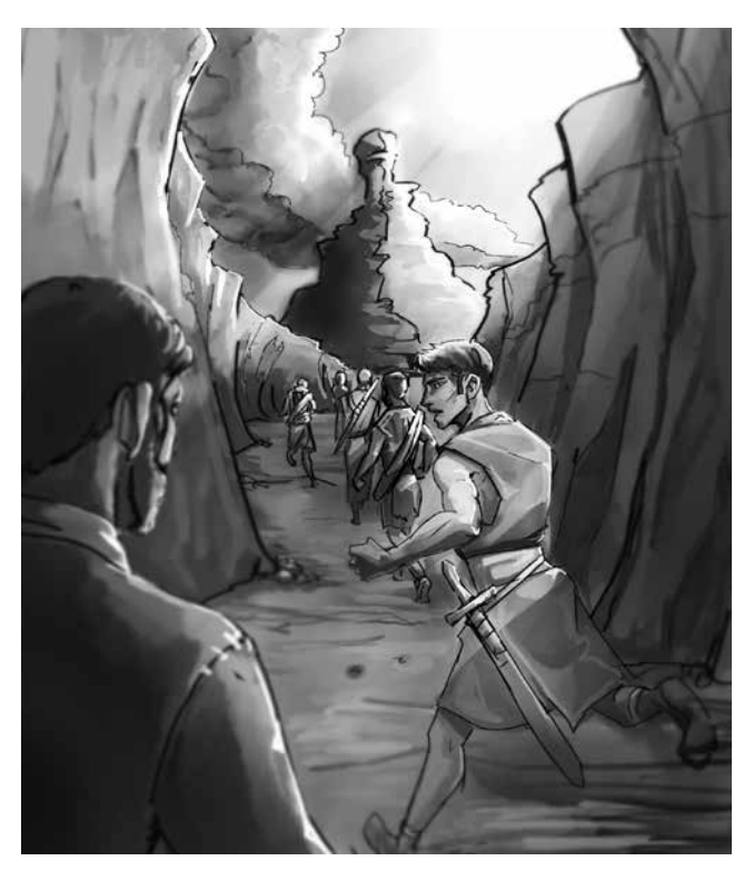
David flees to the wilderness to escape Saul's wrath.

you may do to him as it shall seem good unto