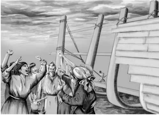
All of humanity mocked Noah for building the ark, but in the end only he and his family were spared.

behold, it was _____; for all _____ had _____ his [God's] way upon the _____. And God said unto _____, The _____ of all _____ is come before me; for the _____ is filled with _____ through them; and, behold, I will _____ them with the earth. Make you an _____ of _____ wood.”