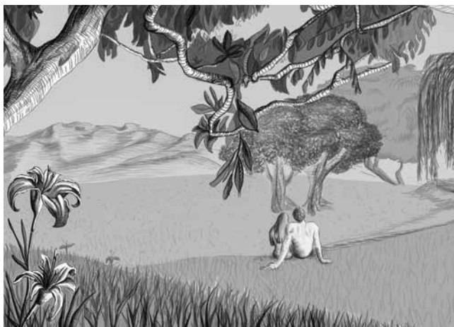
God placed Adam and Eve in the Garden of Eden.

God can only work with and develop those who submit to Him. He can cause them to grow spiritually; He can give them more and more of His Holy Spirit. And finally, when Jesus Christ returns to Earth, those individuals will be transformed into God beings in His Family! This is why humans were created!