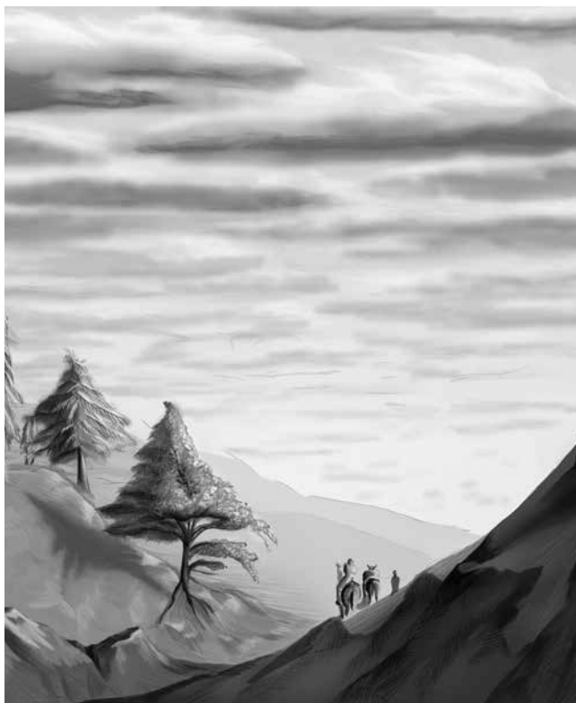
Abraham and Isaac left for Mount Moriah early in the morning.

But Abraham trusted God. God promised that Abraham would be the father of many nations, and they would come through Isaac. Abraham knew that