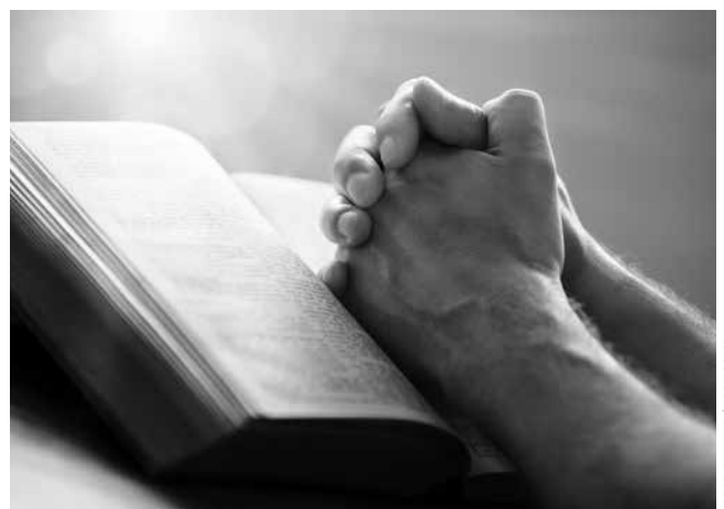
Fasting on Atonement gives us more time for prayer and study.

Turn to Ezra 8:21 to see how to humble yourself before God: “Then I proclaimed a _____ there, at the river of Ahava, that we might _____