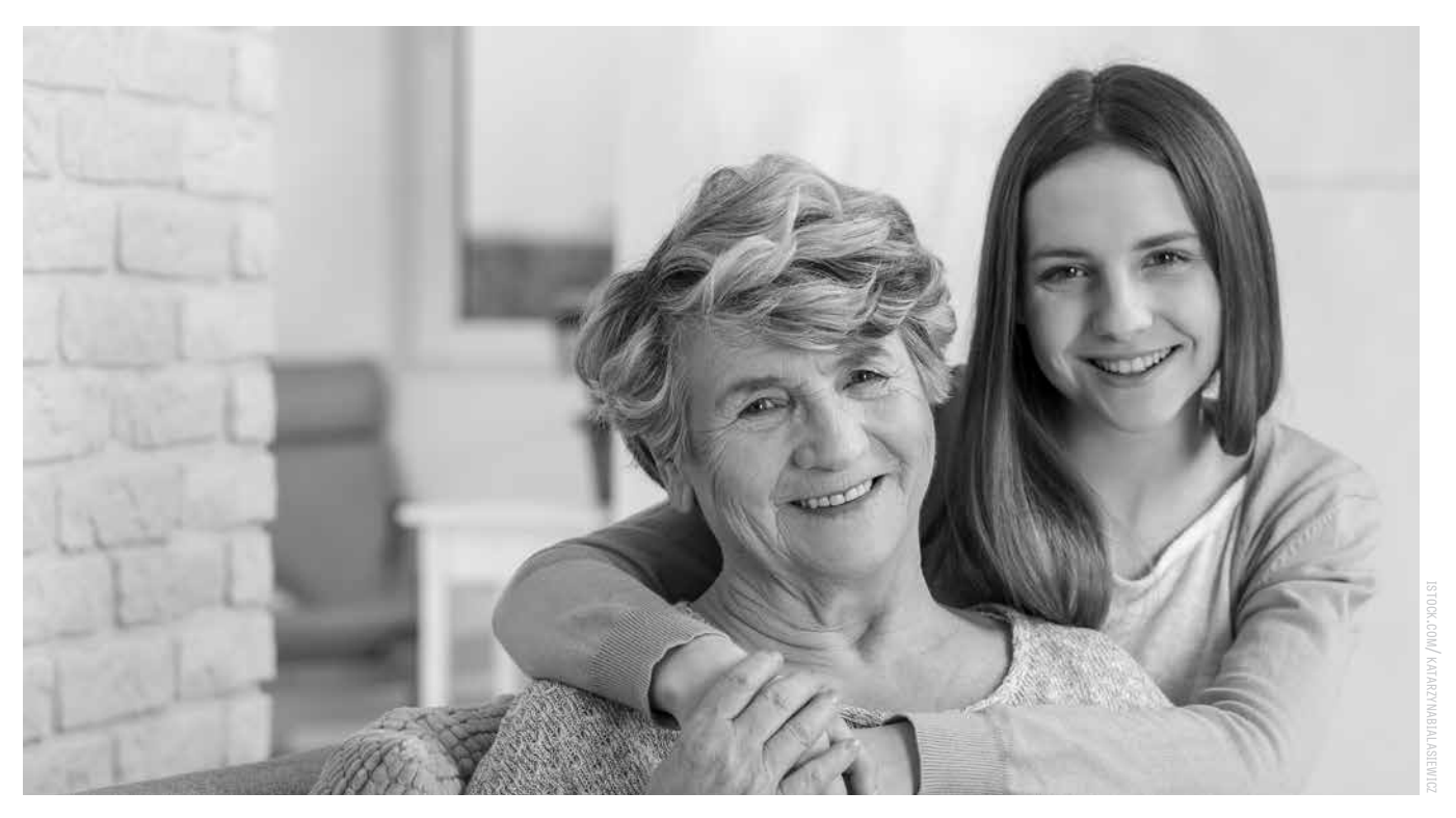
You might even get to teach your own relatives during the Great White Throne Judgment.