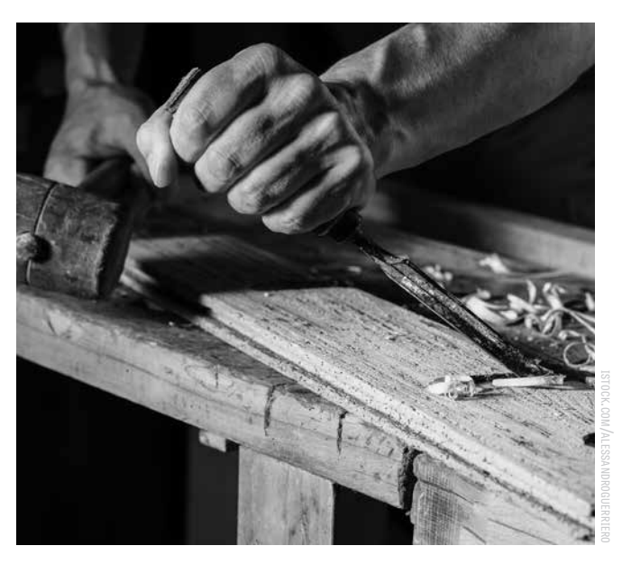
As a young man, Jesus Christ worked as a carpenter.

The horrific beating Christ was able to endure