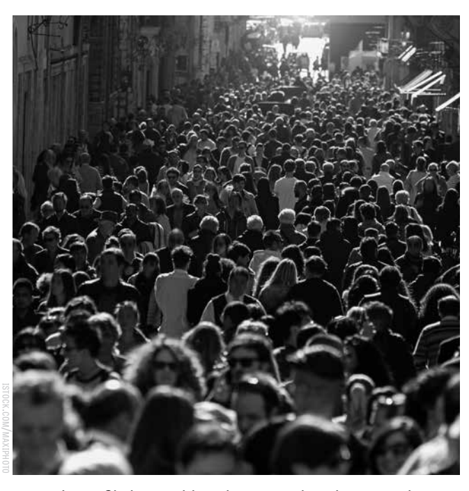
Jesus Christ would not have stood out in a crowd.

The word form in this verse means figure or appearance . Jesus Christ had no unusual physical