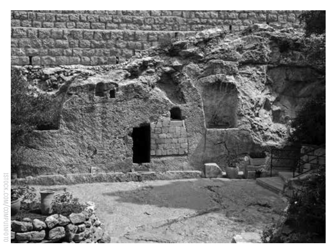
This tomb just outside the Old City of Jerusalem is likely where Christ was buried and resurrected.