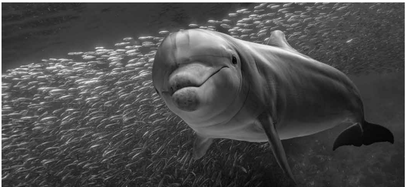
Animals can’t understand art, science or mathematics because they don’t have the human spirit.

Just as the human spirit enables a person to understand things that animals cannot understand,