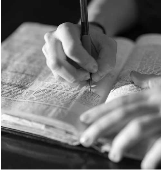
God's Holy Spirit works with the unbaptized children of Church members so they can understand spiritual things.

These teachers will help Jesus Christ train the rest of humanity later!