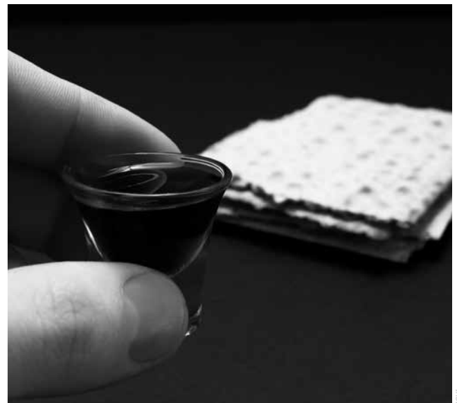
The Passover symbols are unleavened bread and wine.

The Apostle Peter records that Jesus Christ was the Lamb of God , without spot or blemish (1 Peter 1:18-20). The lamb that the ancient Israelites killed on Passover represented the Word, who would become human, live a sinless life, and die for the sins of all mankind!