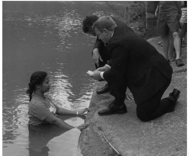
At baptism, God gives us a portion of His Holy Spirit.

Receiving God's Holy Spirit is what makes someone a member of God's Church. God gives His Spirit as a special gift to those adults who repent of their sins, are