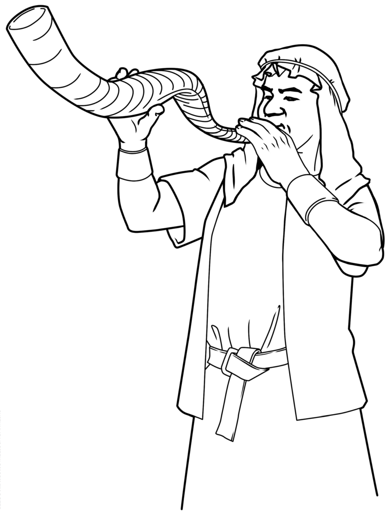
An ancient Israelite blows a shofar to announce the start of the Feast of Trumpets.