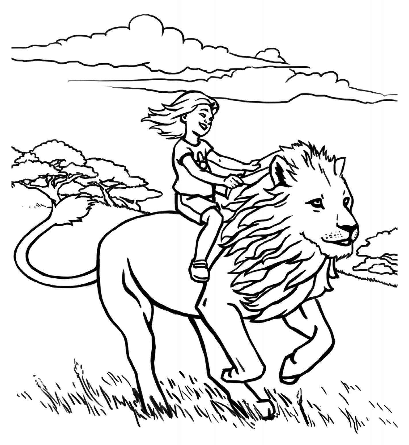
With the nature of animals changed, perhaps you will have a lion as your pet!