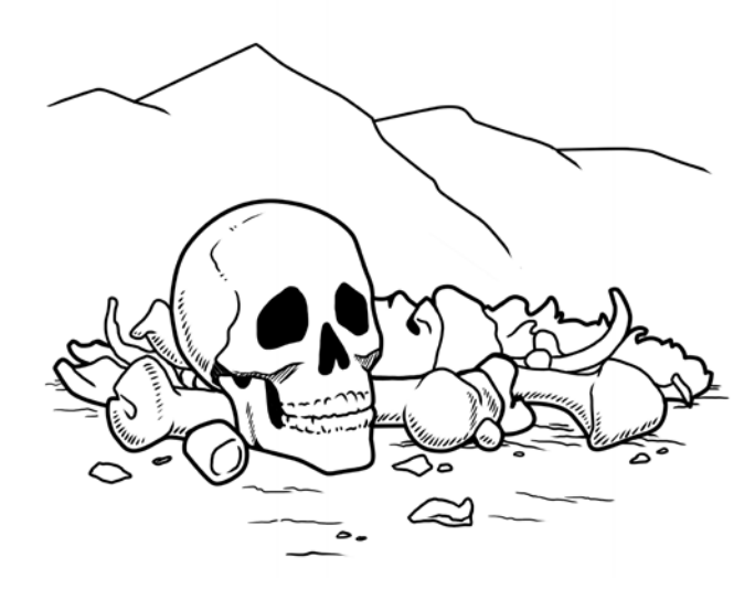
All who have ever lived and died will be resurrected.

The last festival in God's plan is called the Last Great Day. It is a high holy day. It is the day after the seventh day of the Feast of Tabernacles. It pictures a time after the Millennium. During this time, everyone who has