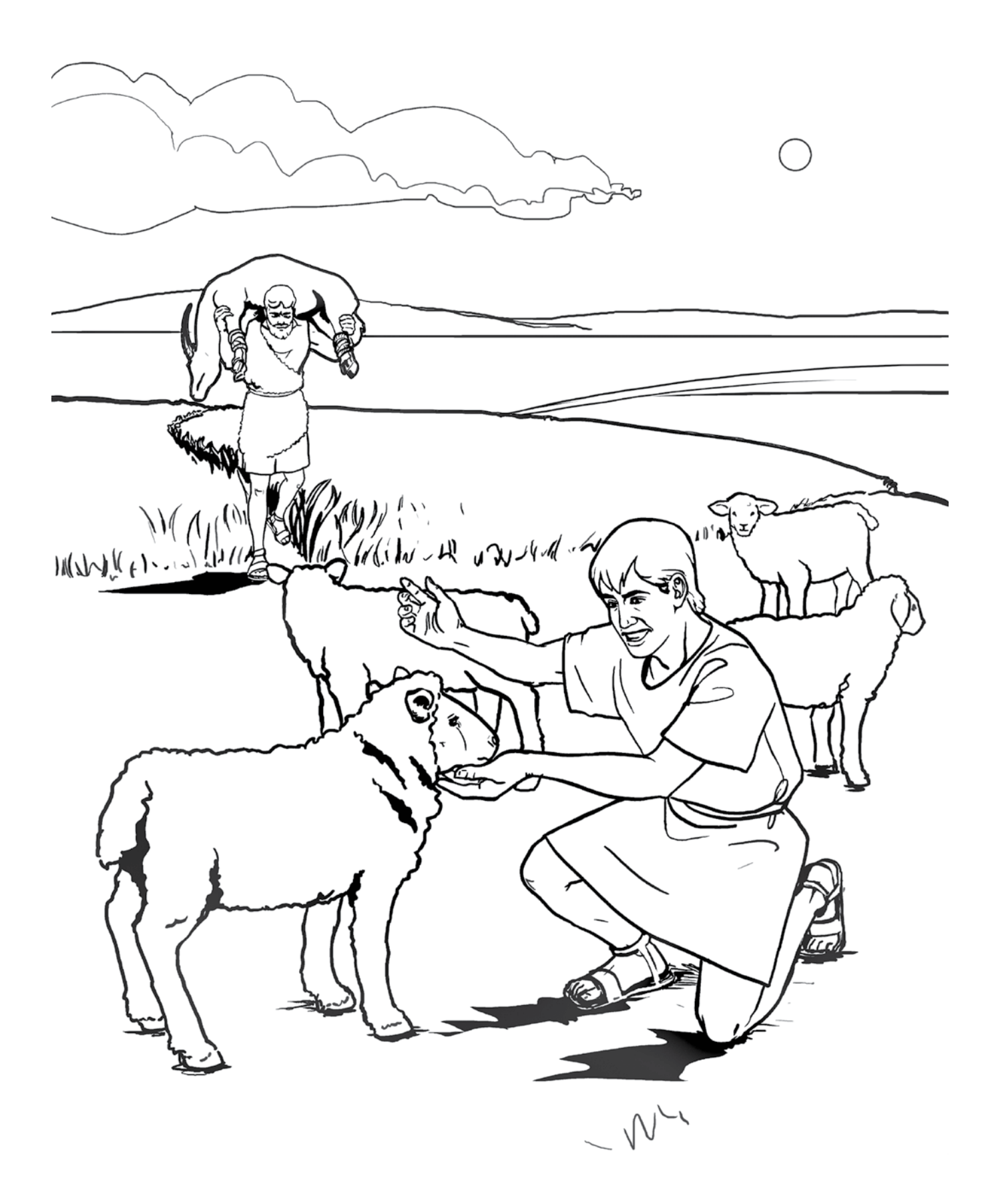
Esau was a hunter. Jacob was a shepherd.