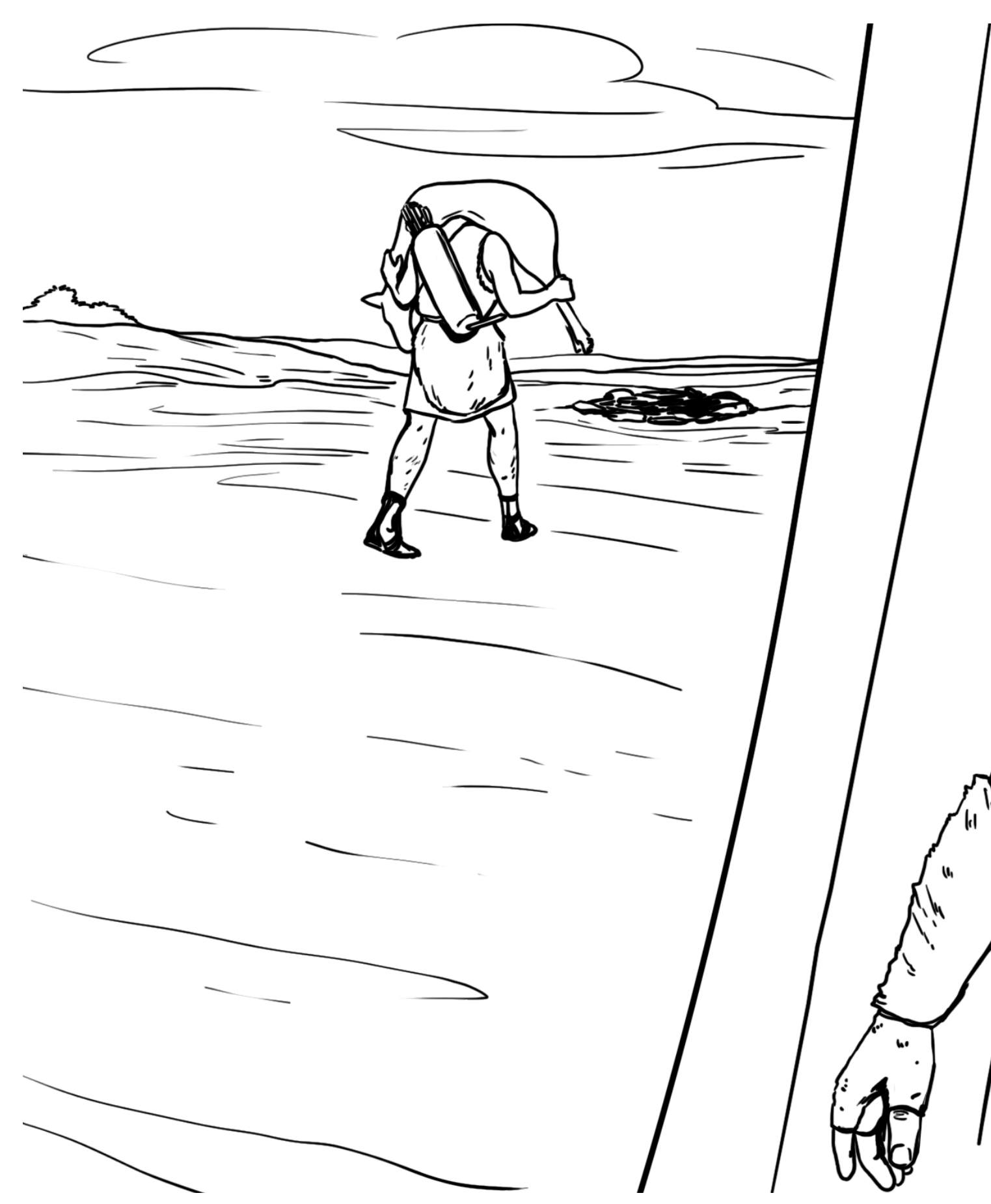
Jacob leaves his father's tent.