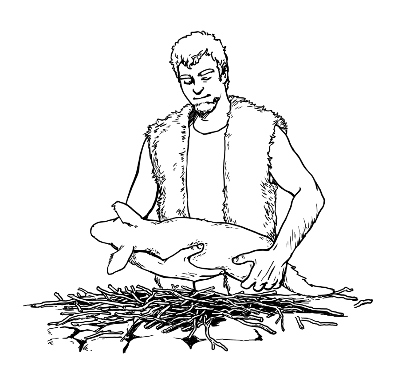
Abel sacrifices a lamb to God.