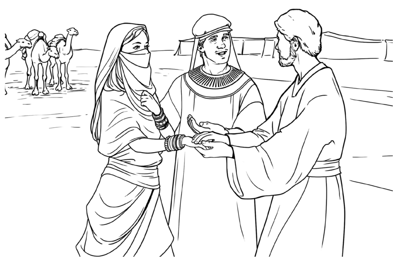
Isaac and Rebekah are introduced.

Several days later, as they neared the end of their journey, Rebekah saw a man walking in the fields and