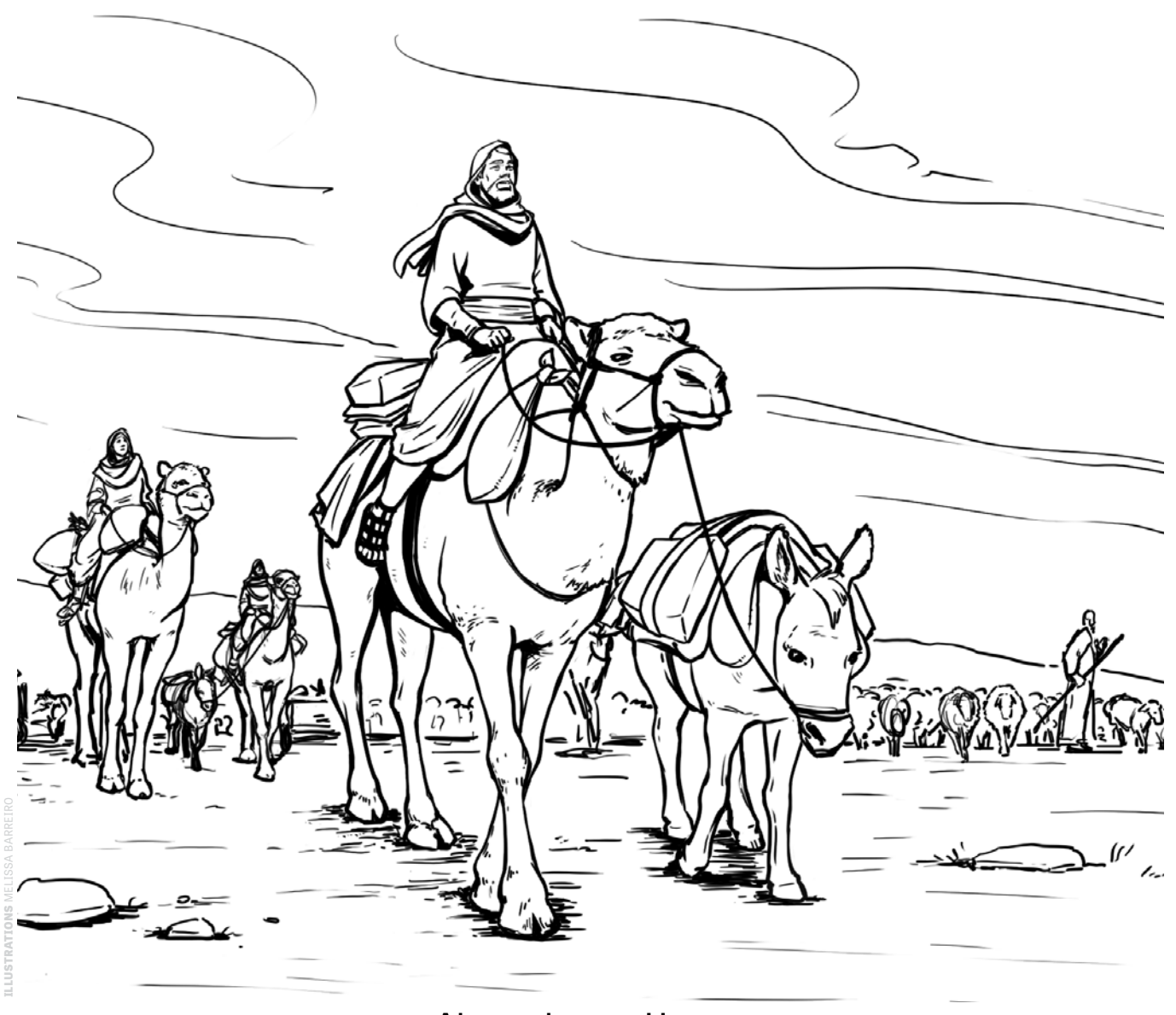
Abram leaves Haran.

But when Abram arrived, Canaan was suffering from a famine. Because there was no rain, fruits and vegetables could not grow. It was difficult to find anything to eat. Abram decided to move to Egypt until the famine passed.